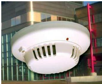
System design is by our in-house Engineering Department

Our fire alarm controls give systems that fulfill the strict requirements of NFPA 72, local, remote, central station and auxiliary, all in the same control panel. They offer flexible, addressable controls that can accommodate many different types of sensors.